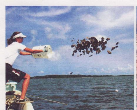
Reef seeding with juvenile oysters.

NCCF's oyster habitat restoration and creation projects have been made possible with the support of its partners, including NOAA's Community Habitat Restoration Program, FishAmerica Foundation, National Fish and Wildlife Foundation, Restore America's Estuaries, NC Sea Grant, NC Division of Marine Fisheries, NC Shellfish Sanitation Section, NC Division of Water Quality, the Albemarle-Pamlico National Estuarine Program, UNC-W and the NC Clean Water Management Trust Fund.