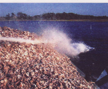
Spreading of oyster shells for new reef base.