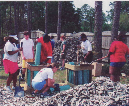
Volunteers filling oyster shell bags.